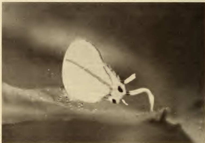
FIG. 1. A specimen of Oxylides faunas seated on a leaf in secondary forest (Agege, Lagos, 14 xii 1980).

As luck would have it I received Robbins' paper a few days before leaving for Nigeria on a business trip, and I hoped to substantiate my recollections of more than 10 years ago. Although limited time was on hand, I managed to observe a total of 61 landings made by 1 male at Akure, Ondo State, 1 male at Benin, Bendel State and 5 males and